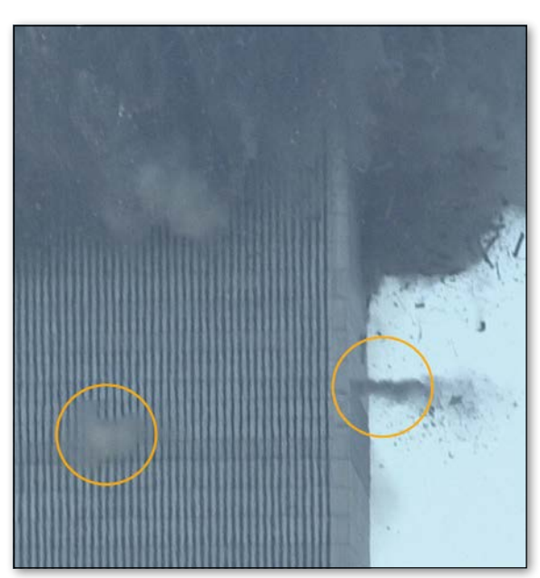
▼FIG. 5: High-velocity bursts of debris, or "squibs," were ejected from point-like sources in WTC 1 and WTC 2, as many as 20 to 30 stories below the collapse front.

NIST sidesteps the well-documented presence of molten metal throughout the debris field and asserts that the orange molten metal seen pouring out of WTC 2 for the seven minutes before its collapse was aluminum from the aircraft combined with organic materials (see Fig. 6) [6]. Yet experiments have shown that molten aluminum, even when mixed with organic materials, has a silvery appearance—thus suggesting that the orange molten metal was instead emanating from a thermite reaction being used to weaken the structure [12]. Meanwhile, unreacted nano-thermitic material has since been discovered in multiple independent WTC dust samples [13].