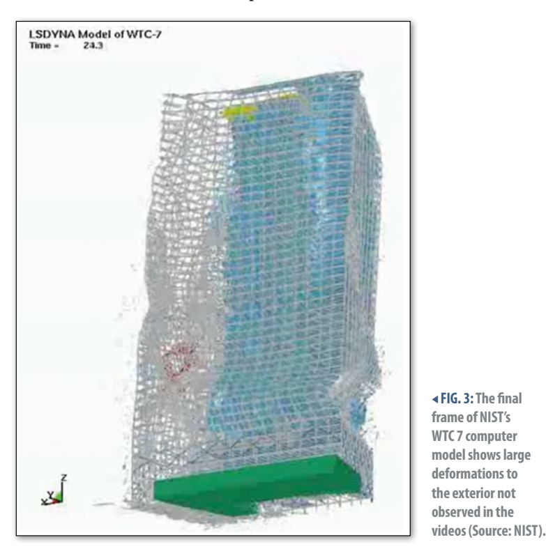
◆ FIG. 3: The final frame of NIST's WTC 7 computer model shows large deformations to the exterior not observed in the

In general, the technique used to demolish large buildings involves cutting the columns in a large enough area of the building to cause the intact portion above that area to fall and crush itself as well as crush whatever remains below it. This technique can be done in an even more sophisticated way, by timing the charges to go off in a sequence so that the columns closest to the center are destroyed first. The failure of the interior columns creates an inward pull on the exterior and causes the majority of the building to be pulled inward and downward while materials are being crushed, thus keeping the crushed materials in a somewhat confined area—often within the building's "footprint." This method is often referred to as "implosion."